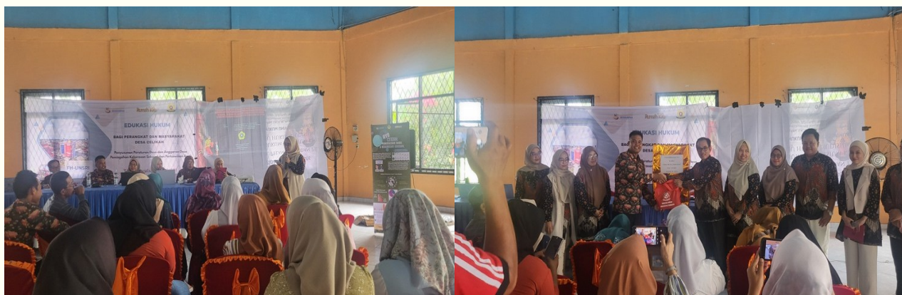
Picture: Implementation of Activities

process and requires the commitment of many parties. Education is not simply about conveying information, but rather a legal empowerment process that builds awareness, changes culture, strengthens reporting, and creates a safer social environment for women, children, and other vulnerable groups. This effort requires program continuity, adequate funding, and regular evaluation to ensure long-term impact. The Community Service Activity in the form of "Legal Education and Reproductive Health Education as an Effort to Prevent Criminal Acts of Sexual Violence in Celikah Village, Kayuagung District, Ogan Komering Ilir Regency, South Sumatra" was carried out in three stages, namely a lecture on sexual violence, a discussion by providing a presentation through a power point about sexual violence, and a question and answer session. Furthermore, several souvenirs were given as mementos to the community who asked questions to the education team as feedback. The materials presented in this service were all related to the theme of Community Service, namely Efforts to Prevent Criminal Acts of Sexual Violence.