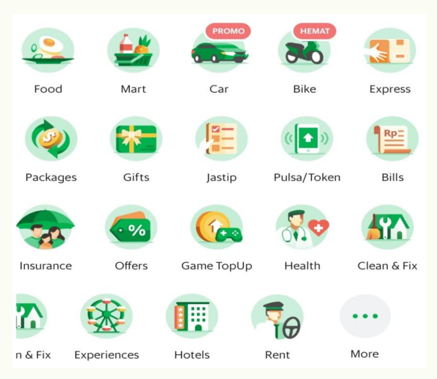
Figure 1. Service Features in Online Transportation (Grab).

services, payment services, body care services (salons) and other features. More details can be seen in the following image: